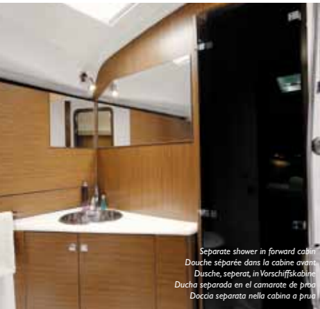
Separate shower in forward cabin Douche séparée dans la cabine avant Dusche, separat, in Vorschiffkabine Ducha separada en el camarote de proa Doccia separata nella cabina a prua