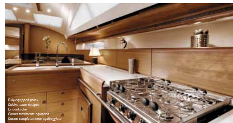
Fully-equipped galley Cuisine toute équipée Einbauküche Cocina totalmente equipada Cucina completamente equipaggiata